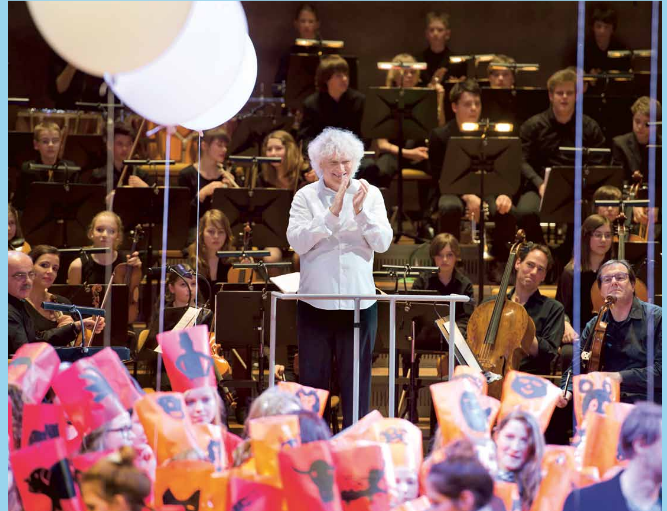
Happy birthday—the Education Programme of the Berliner Philharmoniker has been running for ten years.

Philharmoniker and the Berlin Radio Choir, under Principal Conductor Sir Simon Rattle, transformed the space between the New National Gallery and the Philharmonie into a huge open-air stage. Together with the new children's choir project, Vocal Heroes , they gave a performance of Carl Orff's "Carmina Burana".