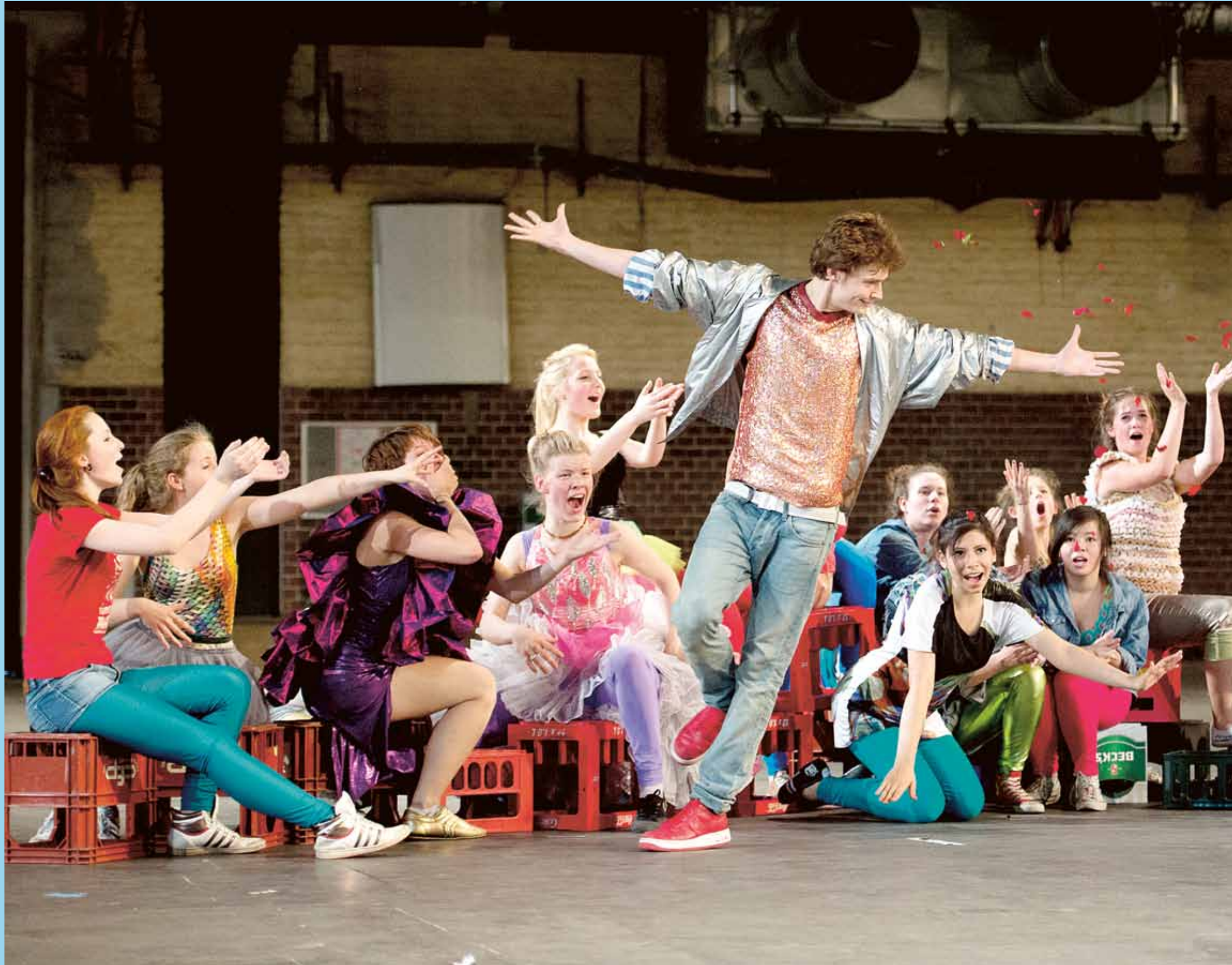
Inspired by "Carmen": Berlin teenagers present Georges Bizet's opera in the Arena Berlin.

25 years of partnership Berliner Philharmoniker and Deutsche Bank