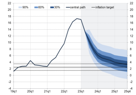
Figure 2. CPI projection