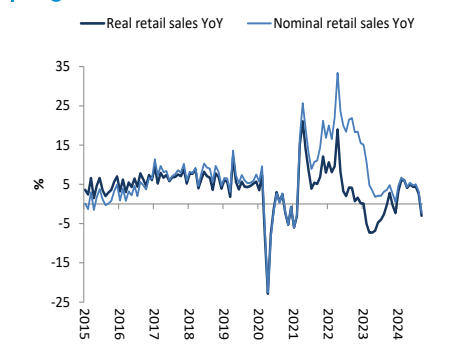
Figure 2. Retail sales