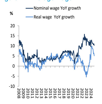
Figure 1. Average wage

Registered unemployment rate amounted to 5.0% in September and has been unchanged for 3 three months in a row. Situation in labour market is still good despite year-on-year decline in employment due to structural deficit of labour.