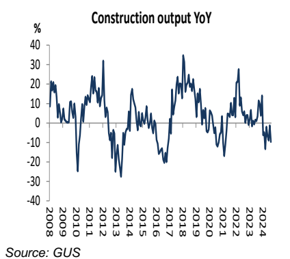
Figure 2. Construction output (y/y growth)