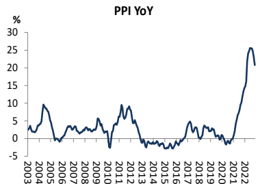
Figure 2. PPI (y/y)