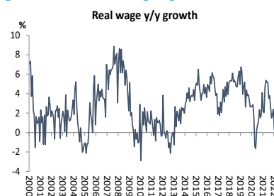
Figure 1: Real wage growth

Economic releases this week consist of money supply for January (due on Tuesday) and consumer confidence for February and unemployment rate for January and Q4 (due on Wednesday).